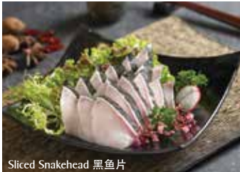
Sliced Snakehead 黑鱼片