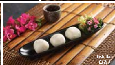
Fish Ball 白香丸