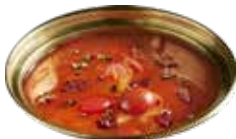
Spicy Mala Tomato Soup Base 麻辣番茄汤底