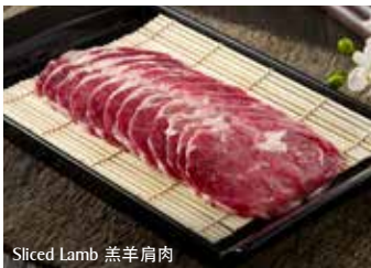
Sliced Lamb 羔羊肩肉