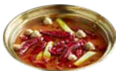
Spicy Szechuan Soup Base 四川麻辣汤底

Each set entitled for one soup base selection only 每人可选一种汤底