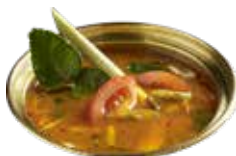
Tom Yum Soup Base 泰式冬炎汤底