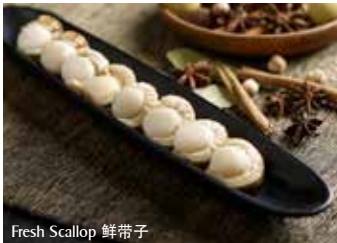
Fresh Scallop 鲜带子