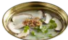
Teochew Style Soup Base 正宗潮州汤底

Terms and Conditions: Valid for dine-in only • Prices are in accordance to Value or Premium menu at respective seating time • Dining duration is 80 minutes based on time of seating, last order will be 20 minutes before end of dining time • Each All-You-Can-Eat set is inclusive of selection of one soup base, free-flow homemade drinks at drinks counter and unlimited snacks and condiments from condiments counter • Surcharge of $3 per person applies during weekends and PH, and is not valid for earning of P$ by PGR members • Add-on orders will be charged at à la carte prices • All diners seated at the same table are required to select the same menu • Food wastage will be charged at $10 per 100gram • Student discount is only valid from Mondays to Fridays, applicable for lunch and tea-time, present valid student pass to enjoy student discount • Child discount is valid for children between 5-12 years old, children below the age of 5 dines for free • Discount given is before surcharge, service charge and prevailing GST • Student and child discount is not valid in conjunction with other discounts, promotions, vouchers or membership privileges • Prices are subject to service charge and prevailing GST • Items are available while stocks last • Management reserves the right to amend terms and conditions of the promotion without prior notice.