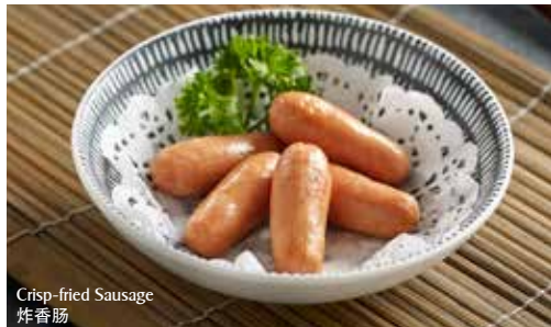
Crisp-fried Sausage 炸香肠