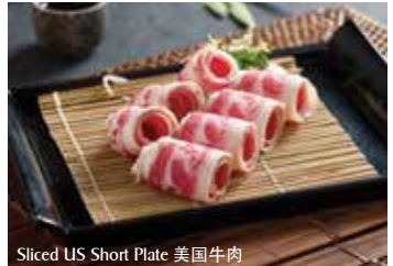
Sliced US Short Plate 美国牛肉