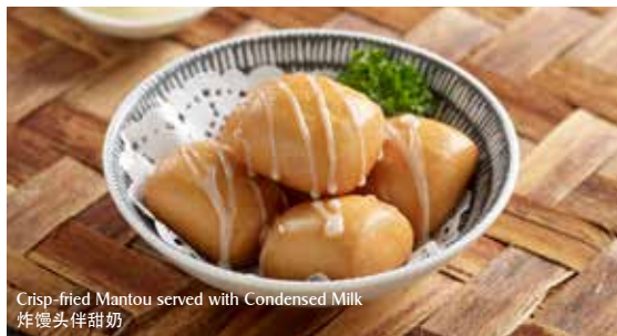
Crisp-fried Mantou served with Condensed Milk 炸馒头伴甜奶