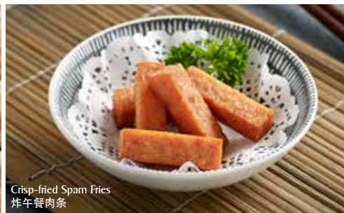
Crisp-fried Spam Fries 炸午餐肉条