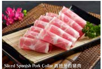
Sliced Spanish Pork Collar 西班牙白猪肉

Pictures are for illustration purposes only