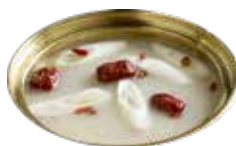
Authentic Pork Bone Soup Base 正宗猪骨汤底