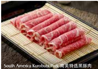
South America Kurobuta Pork 南美特选黑豚肉