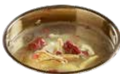
Herbal Chicken Soup Base 药材鸡汤底