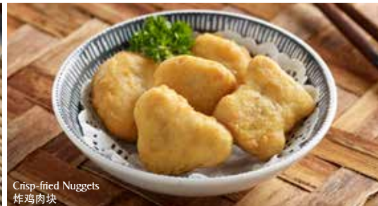
Crisp-fried Nuggets 炸鸡肉块