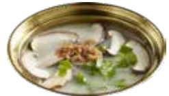
Teochew Style Soup Base 正宗潮州汤底

Terms and Conditions: Valid for dine-in only • Prices are in accordance to Value or Premium menu at respective seating time • Dining duration is 80 minutes based on time of seating, last order will be 20 minutes before end of dining time • Each All-You-Can-Eat set is inclusive of selection of one soup base, free-flow homemade drinks at drinks counter and unlimited snacks and condiments from condiments counter • Surcharge of $3 per person applies during weekends and Public Holidays • Add-on orders will be charged at à la carte prices • All diners seated at the same table are required to select the same menu • Food wastage will be charged at $10 per 100gram • Student and senior citizen discounts are only valid from Mondays to Fridays before 4.30pm, excluding Public Holidays • Present valid student pass or senior citizen card to entitle discount • Child discount is valid for children between 5-12 years old, children below the age of 5 dine for free • Discount given is before surcharge, service charge and prevailing GST • Student, senior citizen and child discounts are not valid in conjunction with other discounts, promotions or vouchers • Prices are subject to service charge and prevailing GST • Items are available while stocks last • Management reserves the right to amend terms and conditions of the promotion without prior notice.