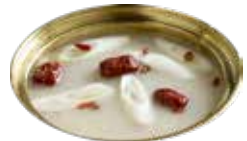
Authentic Pork Bone Soup Base 正宗猪骨汤底