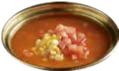
Tomato with Sweet Corn Soup Base 维他命C番茄玉米汤底