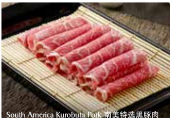
South America Kurobuta Pork 南美特选黑豚肉