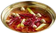
Spicy Szechuan Soup Base 四川麻辣汤底

Each set entitled for one soup base selection only 每人可选一种汤底