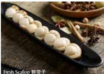
Fresh Scallop 鲜带子