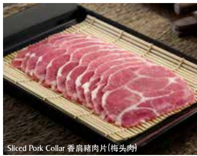
Sliced Pork Collar 香肩猪肉片 (梅头肉)