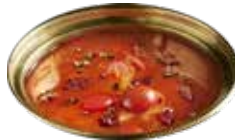
Spicy Mala Tomato Soup Base 麻辣番茄汤底