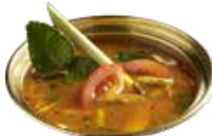
Tom Yum Soup Base 泰式冬炎汤底