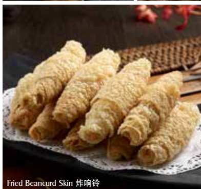
Fried Beancurd Skin 炸响铃