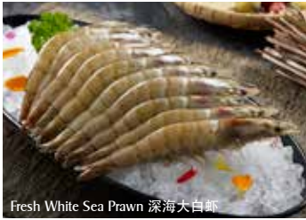
Fresh White Sea Prawn 深海大白虾