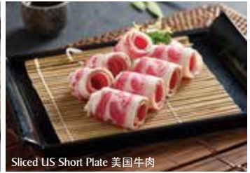
Sliced US Short Plate 美国牛肉