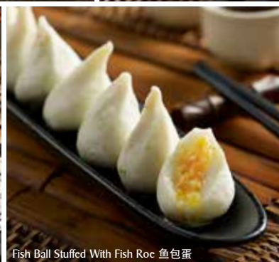
Fish Ball Stuffed With Fish Roe 鱼包蛋