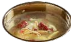
Herbal Chicken Soup Base 药材鸡汤底