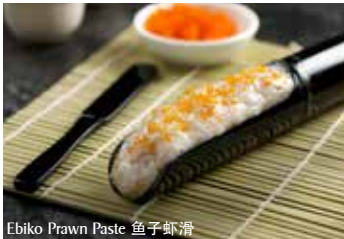
Ebiko Prawn Paste 鱼子虾滑