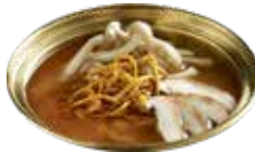
Cordyceps Flower with Mushroom Soup Base (Vegetarian) 虫草花珍菌汤底