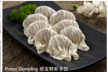
Prawn Dumpling 珍宝鲜虾水饺