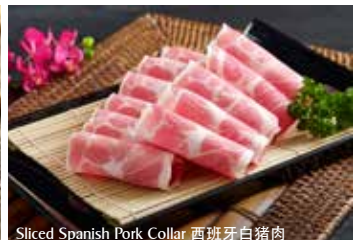
Sliced Spanish Pork Collar 西班牙白猪肉

Pictures are for illustration purposes only