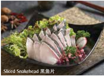
Sliced Snakehead 黑鱼片