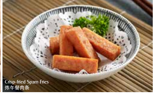
Crisp-fried Spam Fries 炸午餐肉条