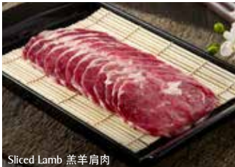
Sliced Lamb 羔羊肉片