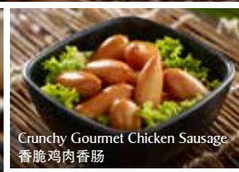
Crunchy Gourmet Chicken Sausage 香脆鸡肉香肠