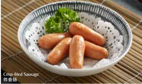
Crisp-fried Sausage 炸香肠