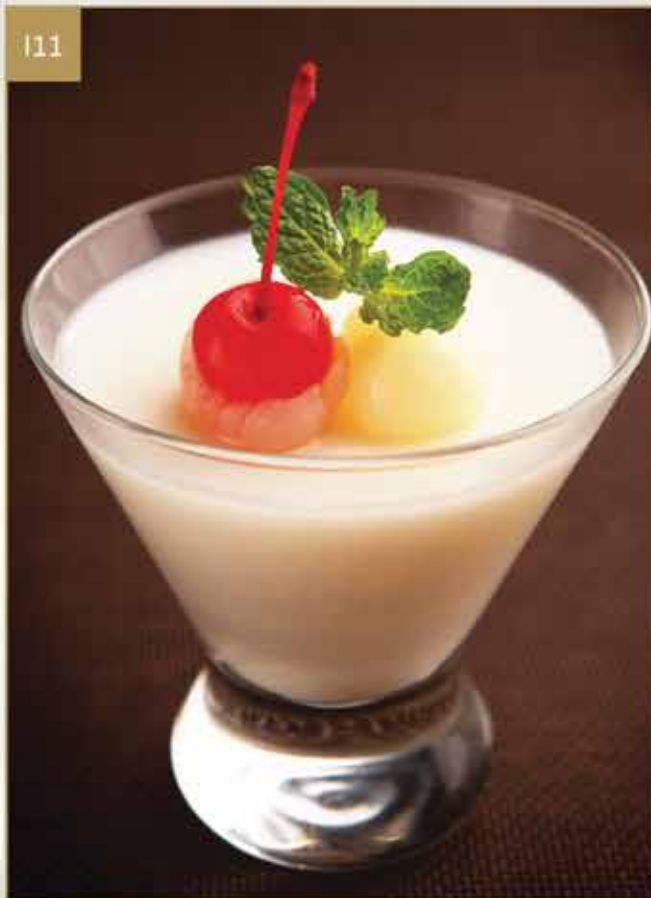
龙眼杏仁布丁 🍓 🍓