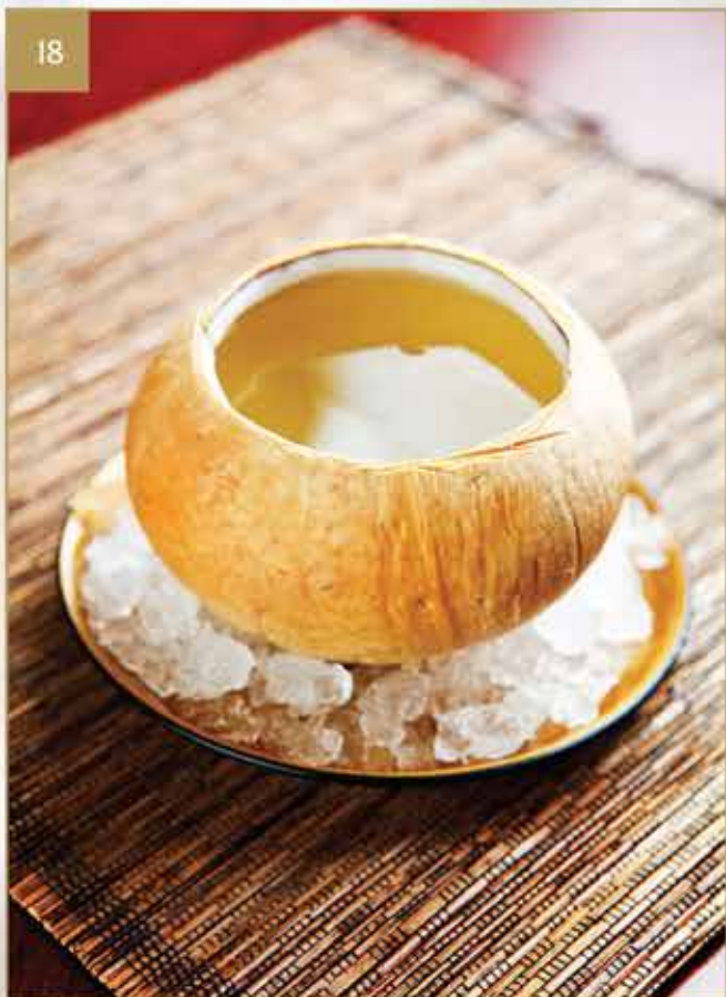
椰皇布丁 Puding Kelapa Coconut Pudding