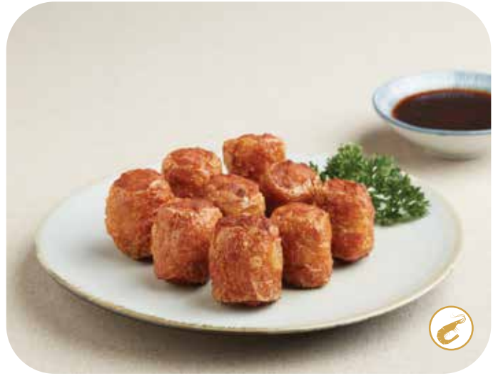
C2 香脆虾枣 Crispy Prawn Roll $12.90 Per Portion (每份)