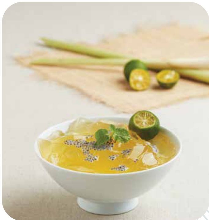
杨枝甘露 (冷) Mango Sago (chilled) $5.90 Per Portion (每份)