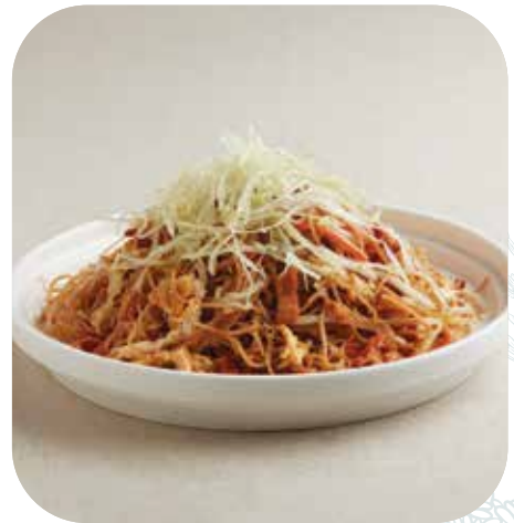
A9 家乡炒面线 Traditional Stir-fried Mee Sua $10.90 | $15.90 Regular (例) | Large (大)