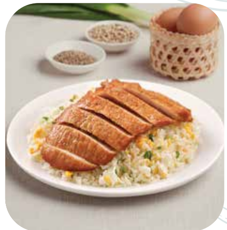
A12 香酥猪扒蛋炒饭 Egg Fried Rice with Crispy Pork Chop $12.90 Per Portion (每份)