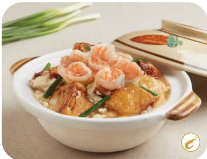
C6 砂锅豆腐虾 Braised Tofu with Prawn in Claypot $17.30 Per Portion (每份)