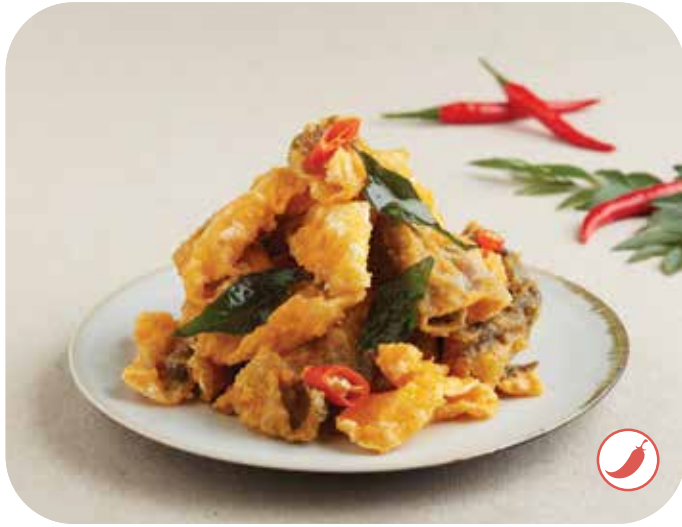
C1 咸蛋鱼皮 Crisp-fried Salted Egg Yolk Fish Skin $12.90 Per Portion (每份)