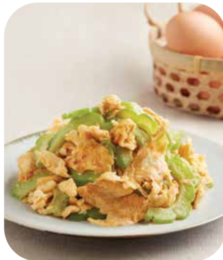
C4 阿婆苦瓜炒蛋 Grandma's Scrambled Egg with Bitter Gourd $11.30 Per Portion (每份)