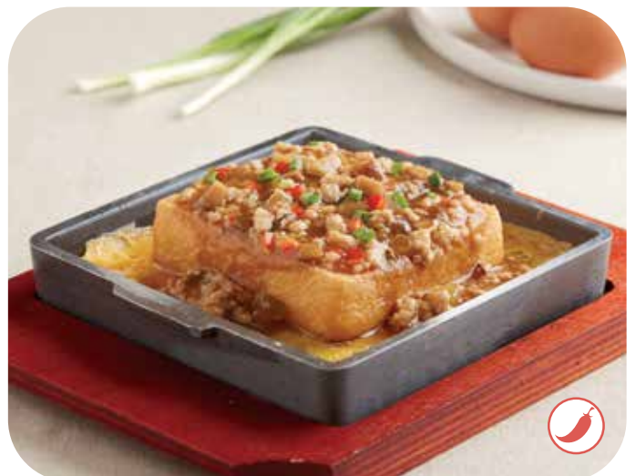
C7 菜香铁板豆腐 Hot Plate Tofu with Preserved 'Cai Xin' and Minced Pork $15.90 Per Portion (每份)