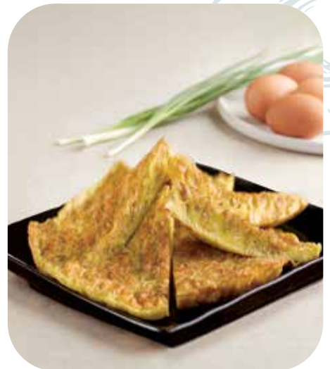
C5 阿婆菜脯煎蛋 Grandma's Pan-fried Egg with Preserved Turnip $11.30 Per Portion (每份)