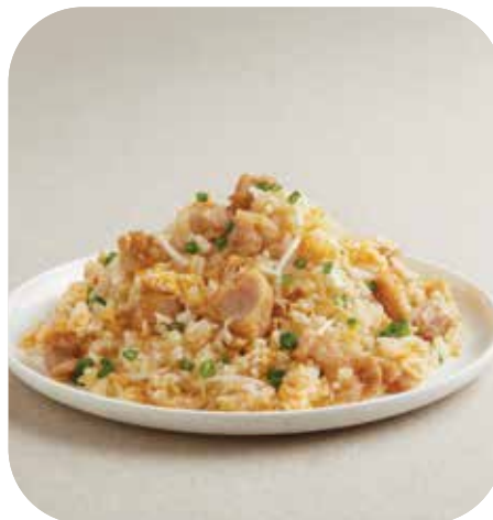
A11 鸡丁银芽炒饭 Diced Chicken Fried Rice $10.90 | $15.90 Regular (例) | Large (大)