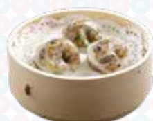
黑松露野菌饺 Steamed Mushroom and Truffle Dumpling (3pc) $10.30 ( )