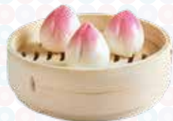
南瓜子莲蓉迷你寿桃 Lotus Seed Paste with Pumpkin Seed Longevity Bun (3pc) $6.60 ( )