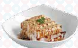
香港车仔街边肠粉 Hong-Kong Street Style Steamed Rice Rolls with Sweet and Peanut Sauce $6.20 ( )