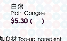
白粥 Plain Congee $5.30 ( )

另加食材 Top-up Ingredient: ( ) 鸡蛋 Egg $0.75 ( ) 皮蛋 Century Egg $2.50 ( ) 油条块 $1.50 Crispy Dough Stick Pieces