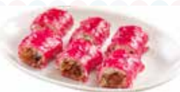
脆网叉烧肠粉 Crispy Rice Roll with BBQ Pork Filling $8.90 ( )