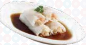
鲜虾蒸肠粉 Steamed Rice Roll with Fresh Prawn Filling $8.20 ( )