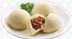
脆皮叉烧包 Crispy BBQ Honey Pork Bun (3pc) $8.60 ( )