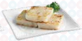
腊味萝卜糕 Pan-fried Radish Cake (3pc) $6.60 ( )