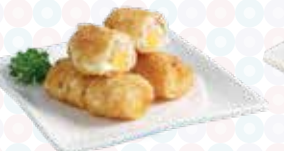
酥脆香芒虾卷 Crispy Prawn and Mango Fritter $8.60 ( )