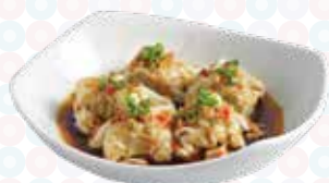
红油抄手 Pork Wonton in Chilli Vinaigrette (5pc) $8.30 ( )