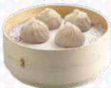
上海小笼包 Steamed Xiao Long Bao (4pc) $7.60 ( )