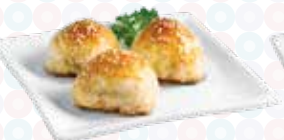
蜜汁叉烧酥 Baked BBQ Pork Pastry (3pc) $8.30 ( )