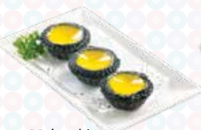
黑金蛋挞 Baked Charcoal Mini Egg Tart (3pc) $6.80 ( )