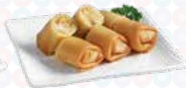
黄金三丝卷 Crispy Vegetable Spring Roll (3pc) $6.60 ( )