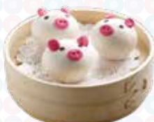
猪仔流沙包 Steamed Molten Salted Egg Yolk Custard Piggy Bun (3pc) $8.30 ( )