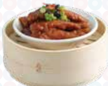
豉汁蒸凤爪 Steamed Chicken Claw with Black Bean Sauce $6.60 ( )