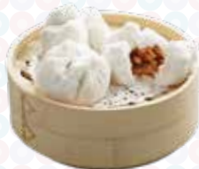
蚝皇叉烧包 Steamed BBQ Honey Pork Bun (3pc) $7.30 ( )