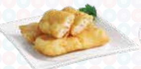
鲜虾腐皮卷 Beancurd Skin Prawn Fritter $8.60 ( )