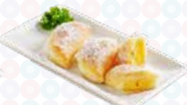
黄金奶黄酥 Baked Golden Custard Pastry (3pc) $8.30 ( )