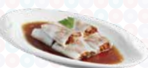
叉烧蒸肠粉 Steamed Rice Roll with BBQ Pork Filling $7.60 ( )