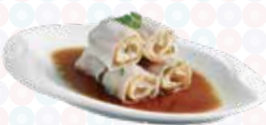
炸两肠粉 Steamed Rice Roll with Dough Fritter $6.60 ( )