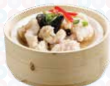
豉蒜蒸排骨 Steamed Spare Rib with Black Bean Sauce and Minced Garlic $6.60 ( )