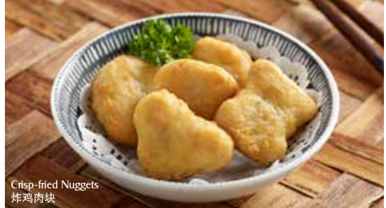
Crisp-fried Nuggets 炸鸡肉块