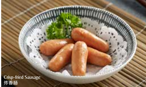
Crisp-fried Sausage 炸香肠