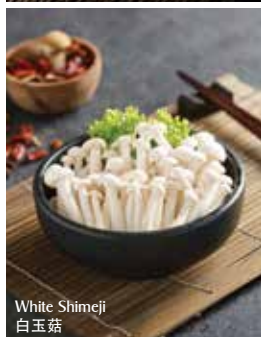
White Shimeji 白玉菇