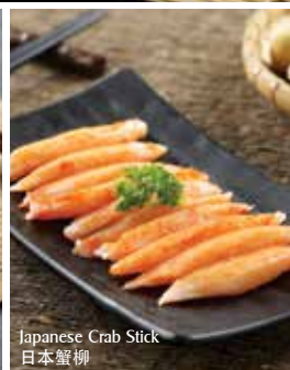
Japanese Crab Stick 日本蟹柳