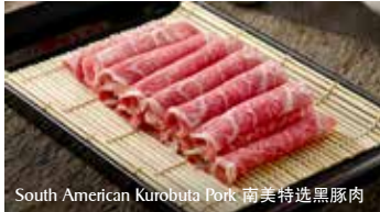
South American Kurobuta Pork 南美特选黑豚肉