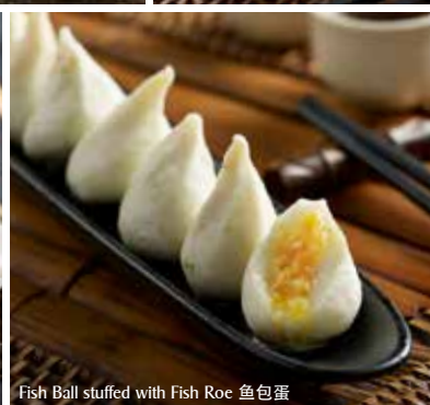
Fish Ball stuffed with Fish Roe 鱼包蛋