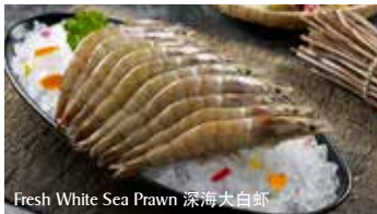
Fresh White Sea Prawn 深海大白虾