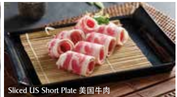
Sliced US Short Plate 美国牛肉