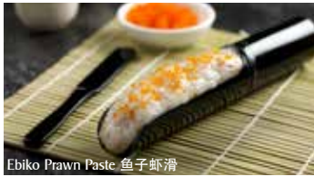
Ebiko Prawn Paste 鱼子虾滑