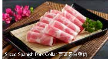
Sliced Spanish Pork Collar 西班牙白猪肉

Pictures are for illustration purposes only