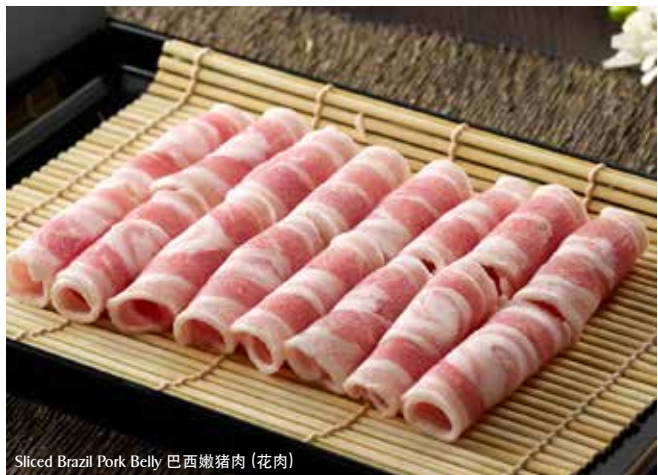
Sliced Brazil Pork Belly 巴西嫩猪肉 (花肉)