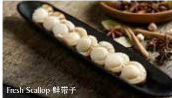
Fresh Scallop 鲜带子