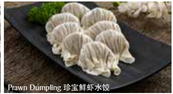
Prawn Dumpling 珍宝鲜虾水饺