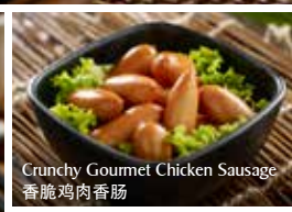
Crunchy Gourmet Chicken Sausage 香脆鸡肉香肠