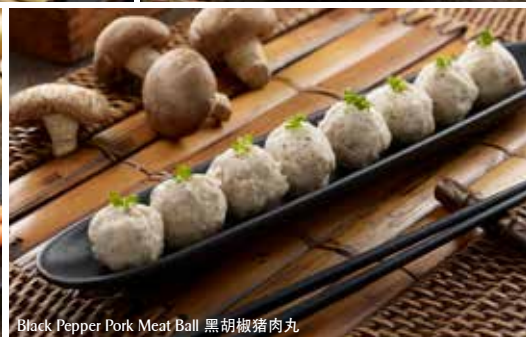
Black Pepper Pork Meat Ball 黑胡椒猪肉丸