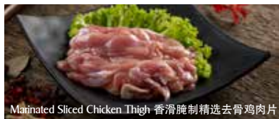
Marinated Sliced Chicken Thigh 香滑腌制精选去骨鸡肉片