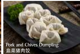
Pork and Chives Dumpling 韭菜猪肉饺