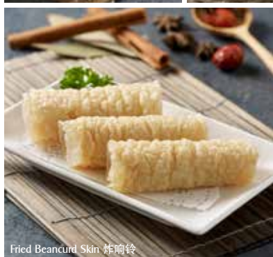
Fried Beancurd Skin 炸响铃