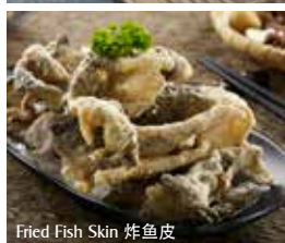
Fried Fish Skin 炸鱼皮