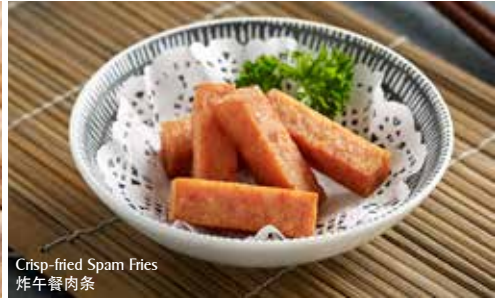
Crisp-fried Spam Fries 炸午餐肉条