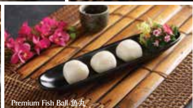
Premium Fish Ball 鱼丸