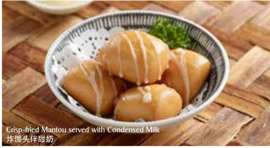
Crisp-fried Mantou served with Condensed Milk 炸馒头伴甜奶