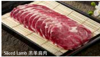
Sliced Lamb 羔羊肩肉