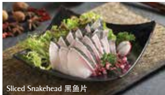
Sliced Snakehead 黑鱼片