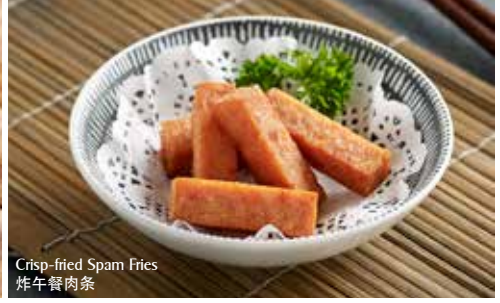
Crisp-fried Spam Fries 炸午餐肉条