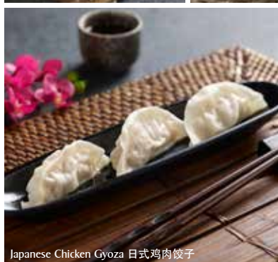
Japanese Chicken Gyoza 日式鸡肉饺子