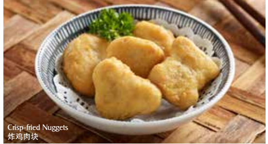
Crisp-fried Nuggets 炸鸡肉块