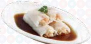
鲜虾蒸肠粉 Steamed Rice Roll with Fresh Prawn Filling $8.20 ( )