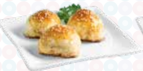
蜜汁叉烧酥 Baked BBQ Pork Pastry (3pc) $8.30 ( )