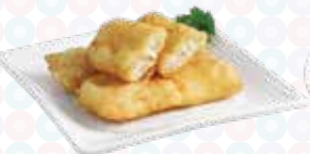
鲜虾腐皮卷 Beancurd Skin Prawn Fritter $8.60 ( )