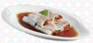
叉烧蒸肠粉 Steamed Rice Roll with BBQ Pork Filling $7.60 ( )