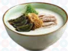
皮蛋爽肉粥 Century Egg and Shredded Pork Congee $9.90 ( )