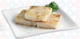
腊味萝卜糕 Pan-fried Radish Cake (3pc) $6.60 ( )