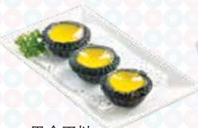
黑金蛋挞 Baked Charcoal Mini Egg Tart (3pc) $6.80 ( )