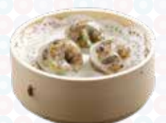
黑松露野菌饺 Steamed Mushroom and Truffle Dumpling (3pc) $10.30 ( )