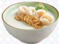
鲜虾球粥 Fresh Prawn Congee $11.90 ( )