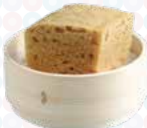
香滑黑糖马来糕 Steamed Black Sugar Sponge Cake $5.60 ( )