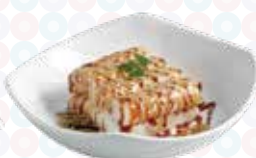
香港车仔街边肠粉 Hong-Kong Street Style Steamed Rice Rolls with Sweet and Peanut Sauce $6.20 ( )