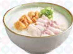
鱼片粥 Sliced Fish Congee $11.90 ( )