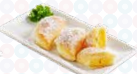
黄金奶黄酥 Baked Golden Custard Pastry (3pc) $8.30 ( )