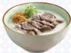
生滚牛肉粥 Sliced Beef Congee $12.90 ( )