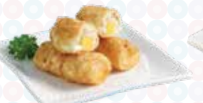
酥脆香芒虾卷 Crispy Prawn and Mango Fritter $8.60 ( )